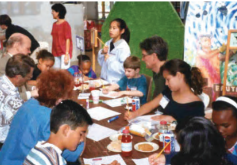
APA conducts workshops to teach planners how to work with youth. This workshop at the San Diego Children’s Museum focused on youth charrettes.